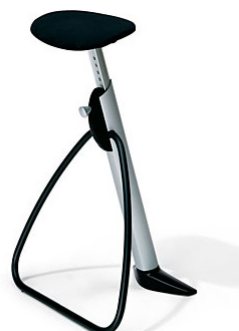
Sedus Smile Stool