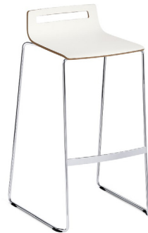
Sedus Meet Stool

Our range of bar stools, as well as perching stools for sit stand desks, offer a variety of design solutions for changing office spaces. View more bar stools