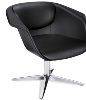
Sedus Sweet Spot