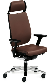
Swing Up Executive