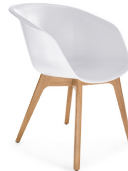
Sedus On Spot